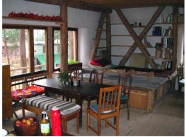
Inside the house.