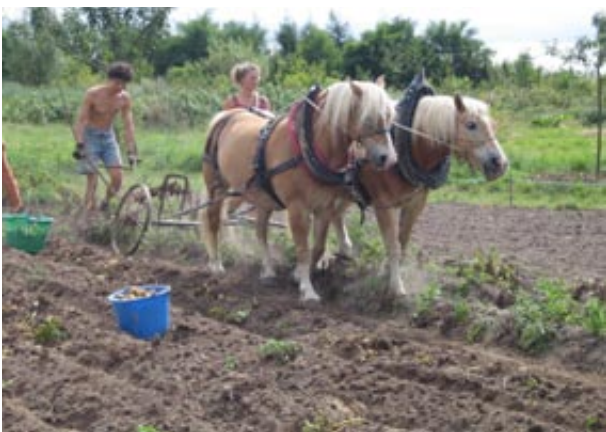
organically treated farms

In Villa Strohbund a sunlight concentrating solar cooker is used in summer on every sunny day for boiling, cooking and baking.