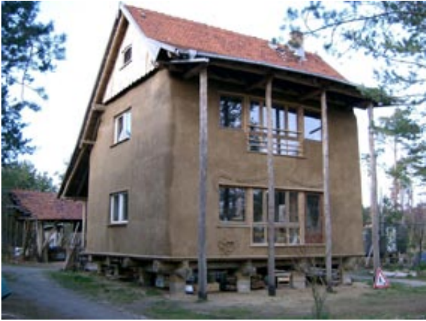
View of the front (southern) side.